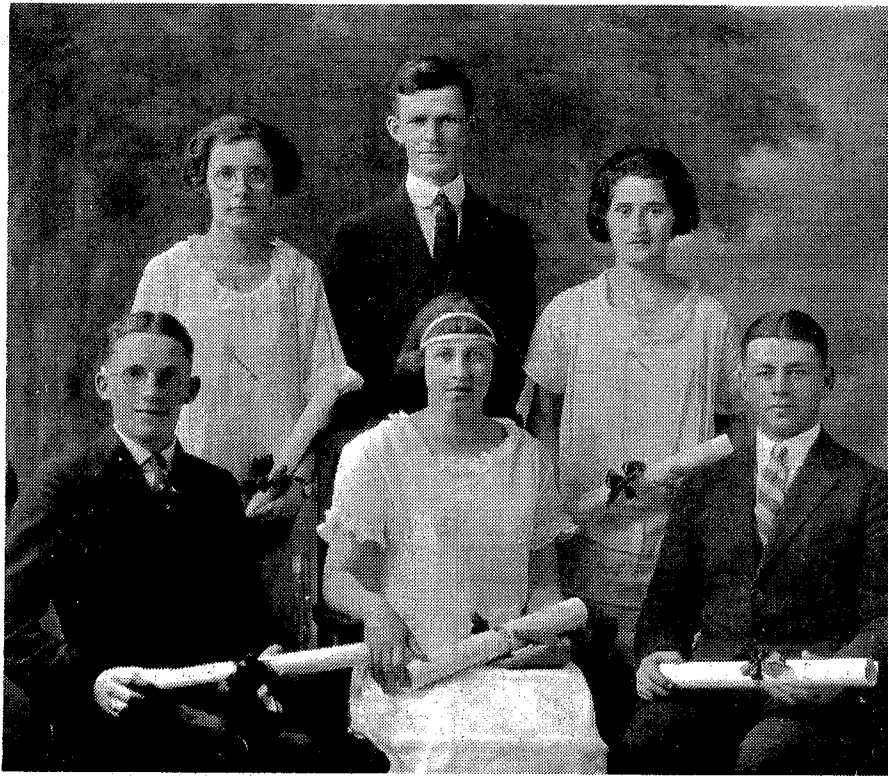
CLASS OF 1924