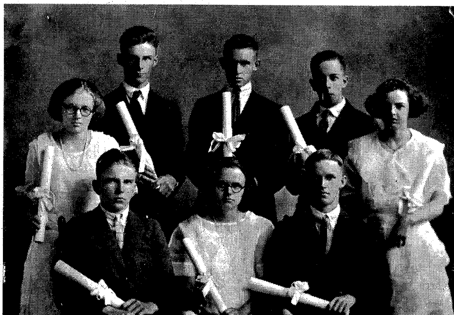
CLASS OF 1923