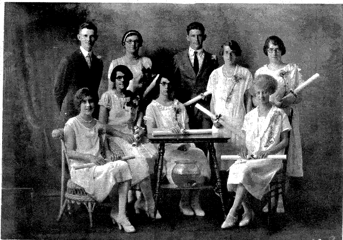
CLASS OF 1926