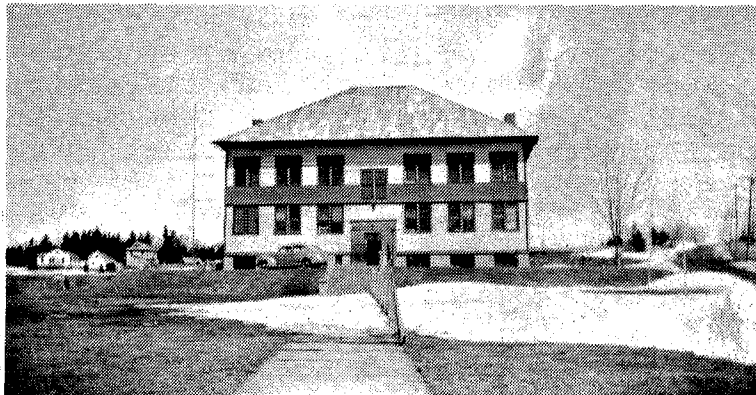
Greensboro High School, Greensboro Vermont

Tell me why the Stars do shine. Tell me why the ivy twines. Tell me why the skie's so blue. Tell me Dear Greensboro Just why I love you.