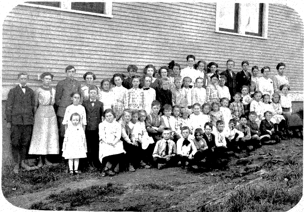
1913 SCHOOL OPENING

PUBLISHED BY THE OFFICERS AND MEMBERS OF THE G H S ALUMNI ASSOCIATION