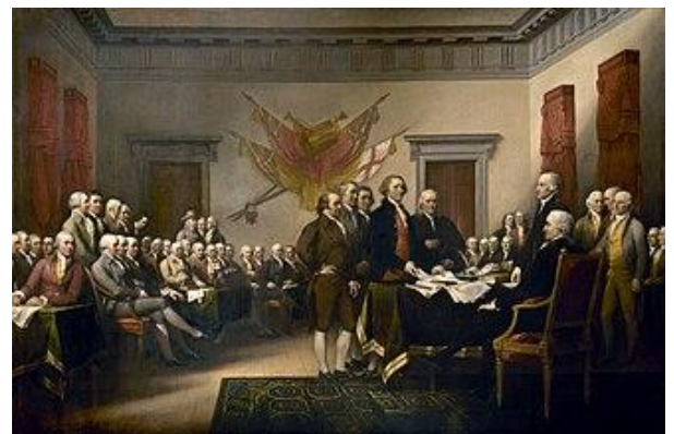
The Declaration of Independence (Trumbull, 1819)

Our Declaration of Independence provides the rationale for severing ties with England as well as the foundational principles of our constitutional republic. Recall these famous words: " We hold these Truths to be self-evident, that all Men are created equal, that they are endowed by their Creator with certain unalienable Rights, that among these are Life, Liberty, and the Pursuit of Happiness .... " These "Truths" are followed by a list of grievances to explain the momentous step the colonists would take. The day this document was signed is recognized as the nation's birthday. The Declaration of Independence is a remarkable document, but one that is easily forgotten in the celebrations that typically mark this holiday. This year, the GHS will have a table with copies of the Declaration available. We invite volunteers to read the Declaration aloud before and after the parade. Please join us to remember what this document means for our country, then and now!