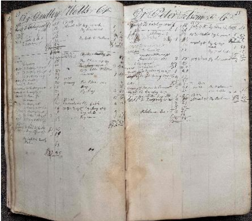
Pages from the mysterious ledger