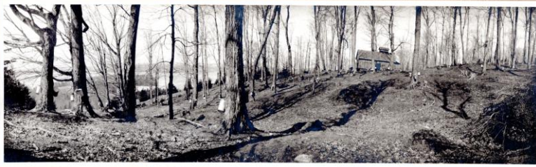
Signer Chipp No. 1 1924

Thank you for the enthusiastic response to our mystery photo (left) in the fall newsletter. The consensus is that the “where” is...Baker Hill! But the “who” remains a mystery. “The Nomad” also photographed the Melvin Homestead in 1924. Please send any clues about The Nomad to collections@greensborohistoricalsociety.org .