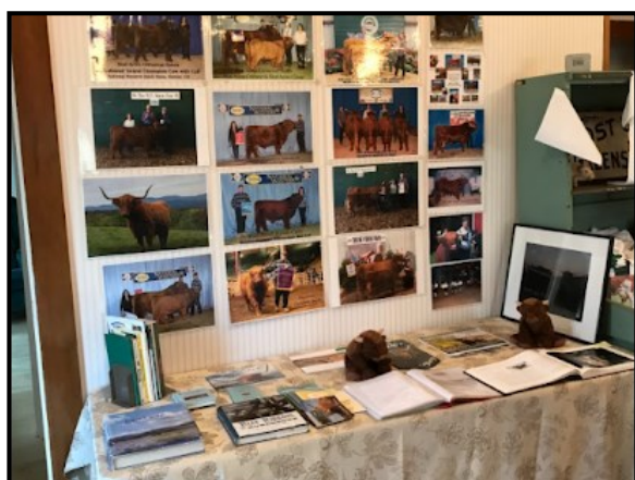
Display of some of the awards won by Shat Acres

During our annual book sale and ice cream social, lucky visitors had a chance to meet and pet two Highland calves. Despite a generally slower stream of people this year due to COVID-19, multiple school field trips came to the GHS summer exhibit and visitors' names filled up our guestbook!