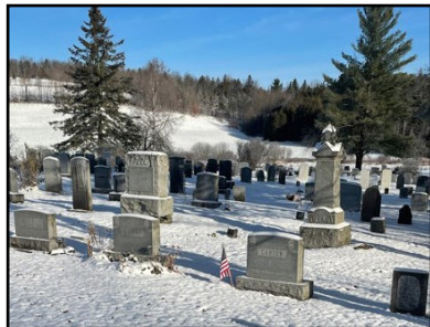
Lincoln Noyes Cemetery

Did you know that there are four official town cemeteries in Greensboro (plus the one at St. Michael's church)? Unlike those in major