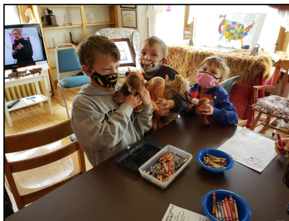
Several groups of school children visited the exhibit where activities included the cow identification game