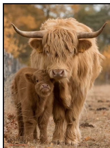
Mother and calf pose