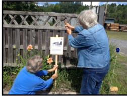
Setting up History Walk