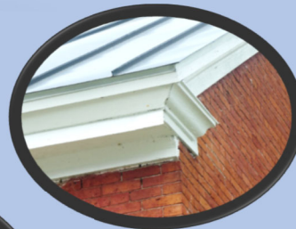
Entablature of a Bay Window