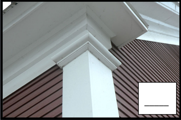
Corner Pilaster with Molded Capital