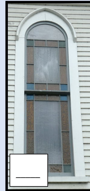
Gothic Arch Window