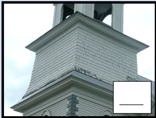
Shingle-Clad Steeple Base