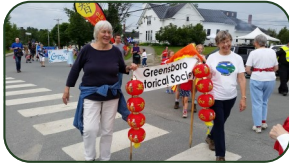
GHS and Chinese dragon July 4 parade 2017