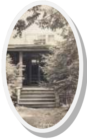
"Hiram's Lodge" (now Landon's ) See on Facebook

Greensboro Historical Society P. O. Box 151 Greensboro, VT 05841