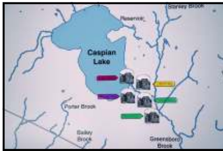
Map of the early mills in Greensboro

Our 2016 exhibit in the front room of GHS, “The River Runs Through It” will include the history of the mills that built Greensboro and Greensboro Bend, the story of the water system in both villages, recreation on water, ice and snow, ice harvesting, maple sugaring, logging, and an ecology corner with some of the creatures that live in our lakes, ponds and streams. We look forward to seeing you, your children and grandchildren.