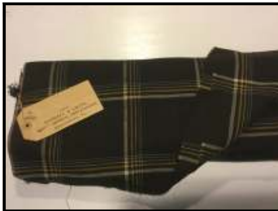
Bolt of cloth from Randall & Crane, transferred to Willeys in 1900, now at GHS

Burt Willey bought the store from Randall and Crane in 1900 and a few objects from the previous store are there: the R and C safe was too heavy for our collection but Rob Hurst retrieved it. A bolt of cloth, as pristine as the day Burt Willey took over the store, is in our collection.