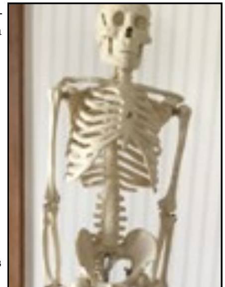
Did the doctor see this one? One of the surprise displays