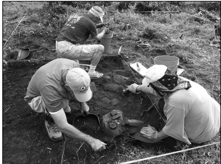
Archaeologists exploring the site of the blockhouse

For generations the legend of the Revolutionary War period Greensboro blockhouse has fascinated and intrigued historians, aficionados and town residents alike. The story of the blockhouse and those who built it is the story of the early pioneers, their courage and endurance, as they forged a new path for both the fledgling United States of America and the town of Greensboro, Vermont. The soldiers and the first residents who occupied the structure made significant contributions to the formation of the nation, the state and the town. The foundation they laid then had a lasting impact on the Greensboro community as is evidenced in the vibrant cultural and social life of the town today. By studying the blockhouse we may learn more about these pioneering settlers and their way of life, bringing to life a little known chapter in our nation's history.